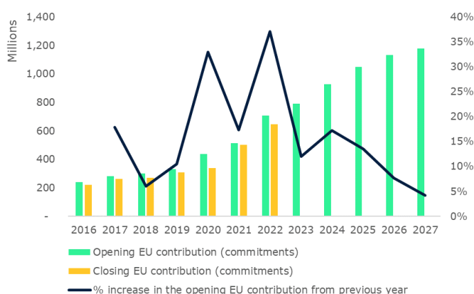
Figure 2 EU contribution to Frontex (2016-2027)

Source: ICF, based EU budget data from MFF 2014-2020 and MFF 2021-27.