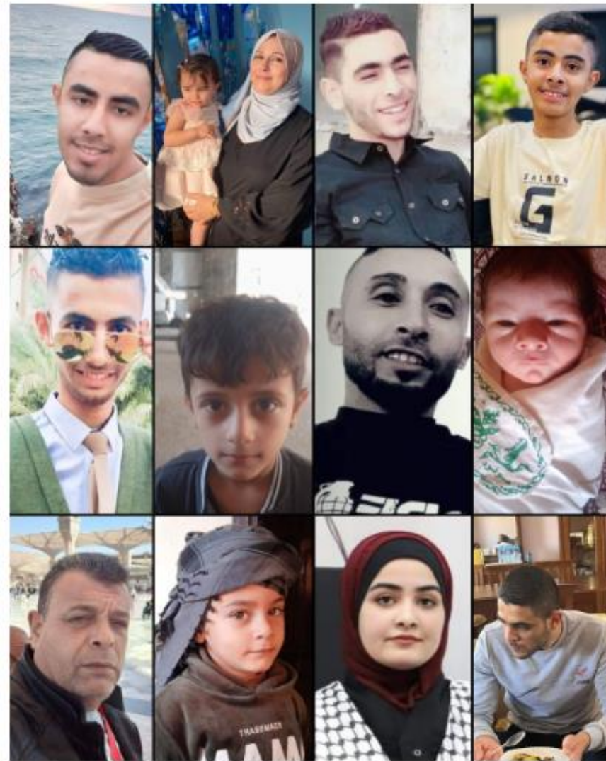
Members of the Al Najjar family who were killed in the strike.

On 10 October at approximately 8.30pm, an Israeli air strike killed 21 members of the al-Najjar family when the family home in Deir al-Balah was bombed. Three neighbours were also killed.