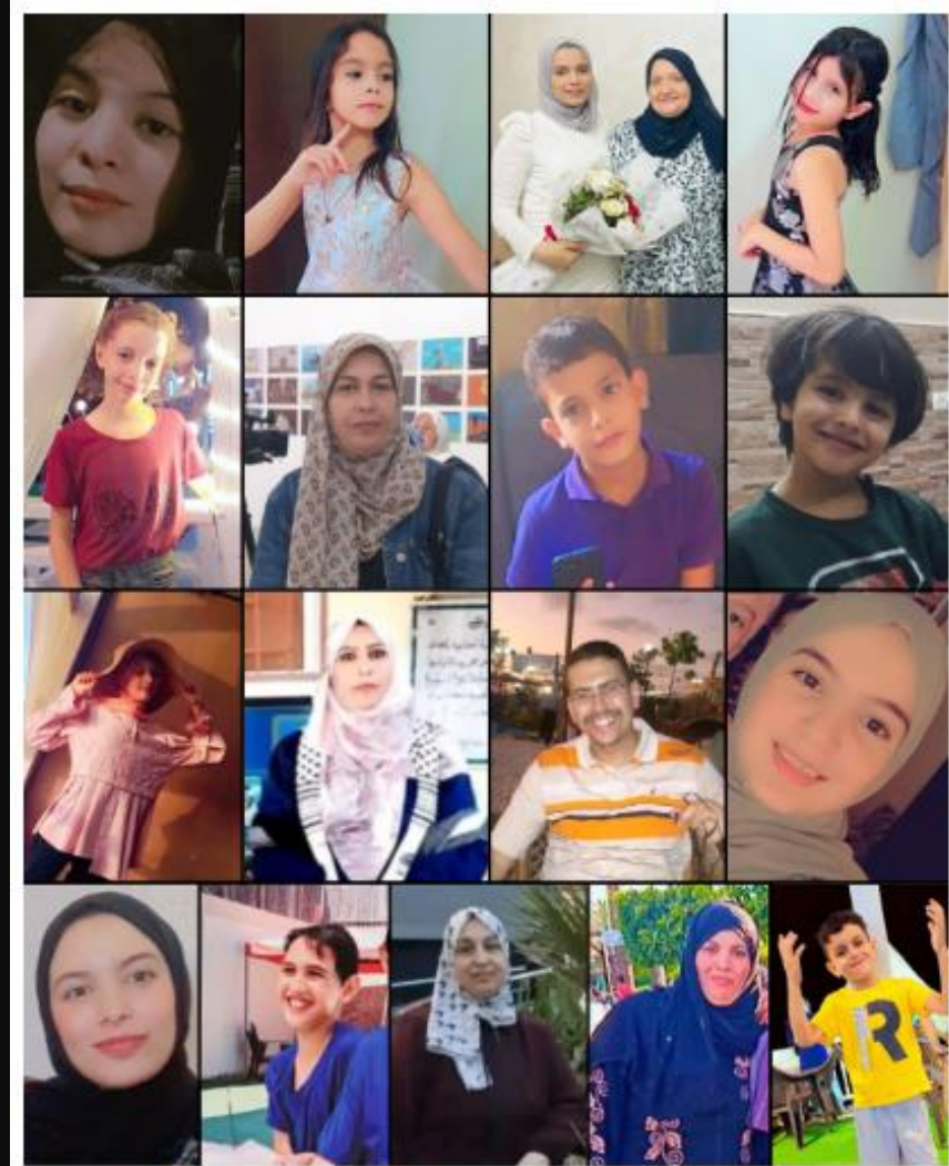
Members of the Abu Mu'eileq family who were killed in the strike.