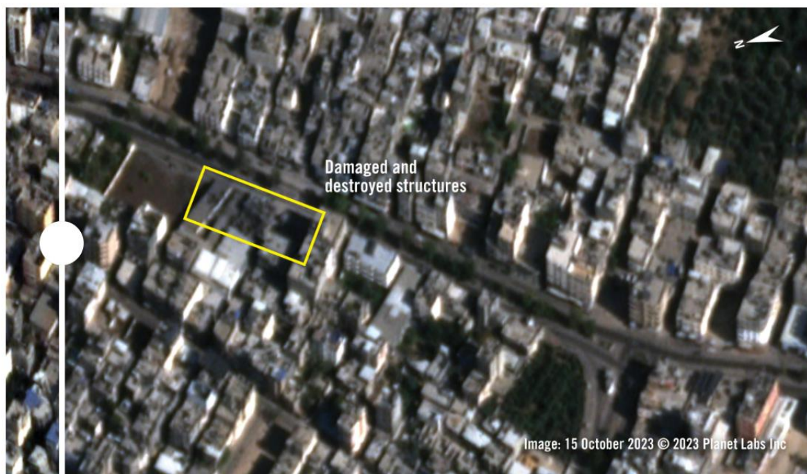
al-Sahaba Street, Gaza: Satellite imagery from 10 October 2023, shows the buildings along the street before the event. On 15 October 2023, buildings appear heavily damaged or destroyed.

According to Amnesty International’s findings there were no military objectives in the house or its immediate vicinity, this indicates that this may be a direct attack on civilians or on a civilian object which is prohibited and a war crime.