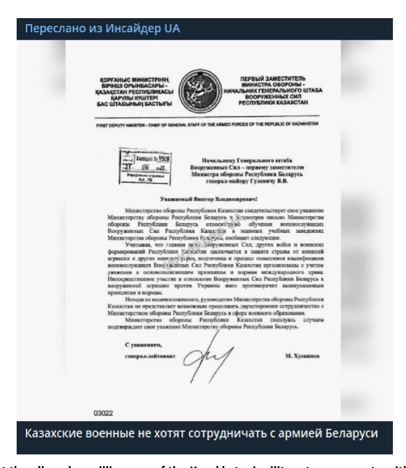
Fake news about the alleged unwillingness of the Kazakhstani military to co-operate with the Belarusian army

In July 2022, information began to circulate in Ukrainian telegram channels that Kazakhstan had allegedly suspended cooperation with Belarus in the field of military education due to Belarus' involvement in aggression against Ukraine. This news was denied by the Ministry of Defence of the Republic of Kazakhstan.<sup>165</sup>