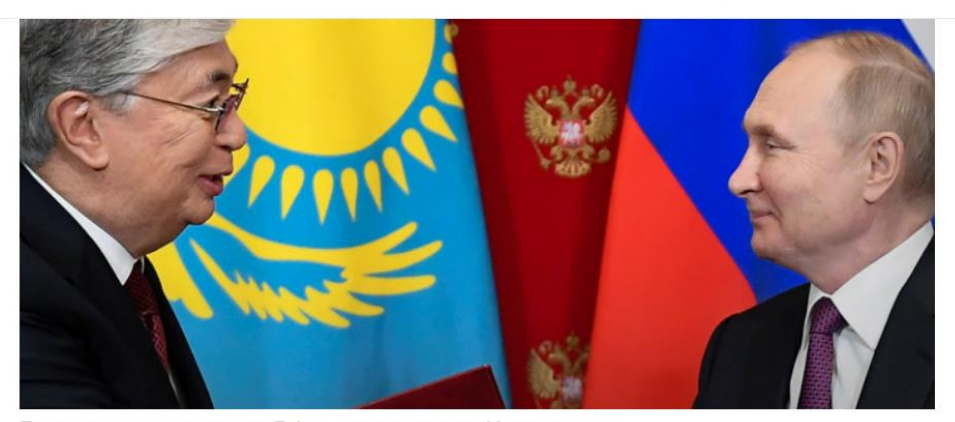
Встреча президента РФ и президента Казахстана

Москва. 28 ноября. INTERFAX.RU - Президент Казахстана Касым-Жомарт Токаев заявил, что поддерживает высказанное президентом РФ Владимиром Путиным предложение создать некий трехсторонний союз РФ, Казахстана и Узбекистана, в том числе для решения вопросов в газовой сфере.