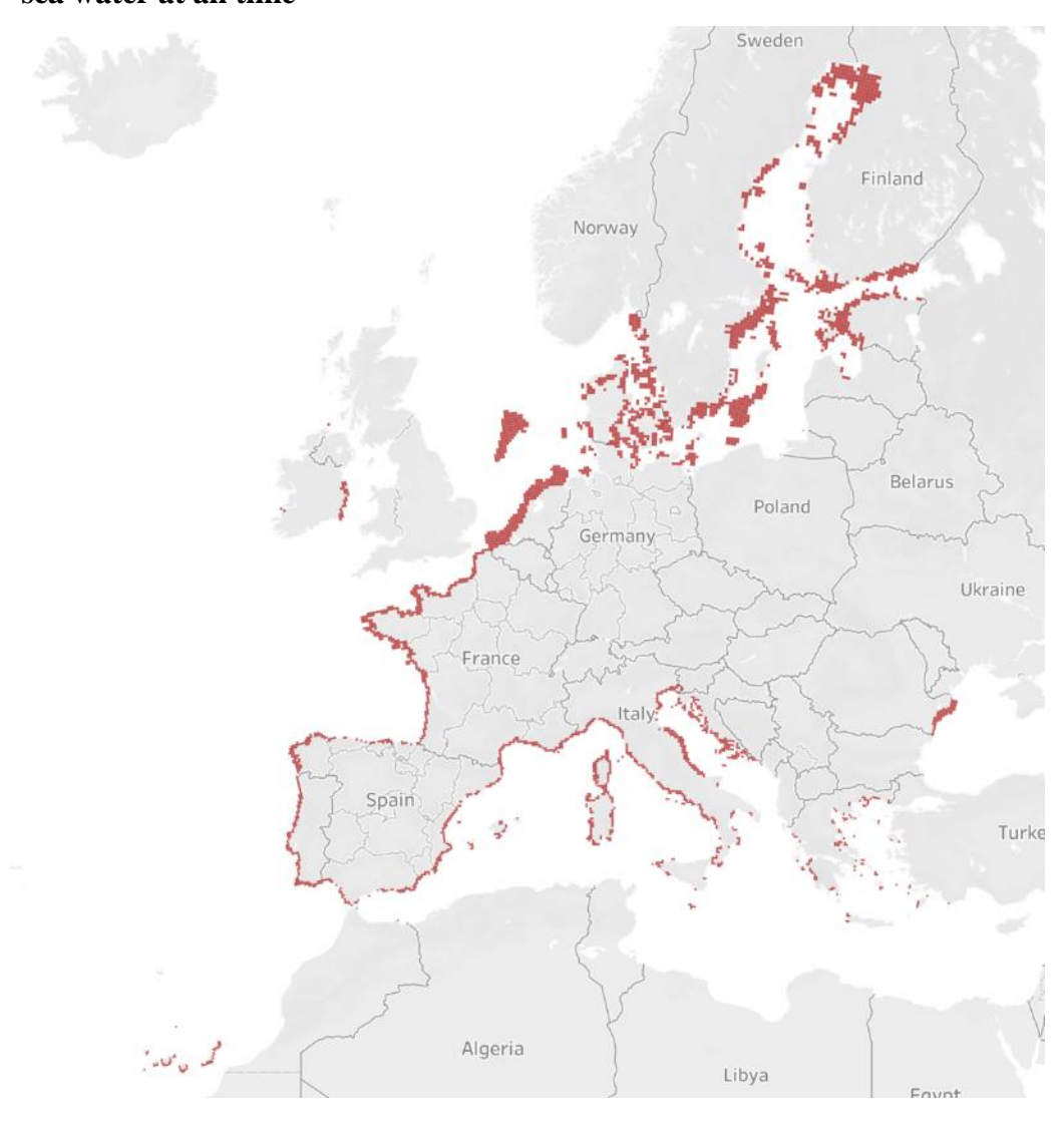
Map 2 – Distribution of habitat 1110 – Sandbanks which are slightly covered by sea water at all time