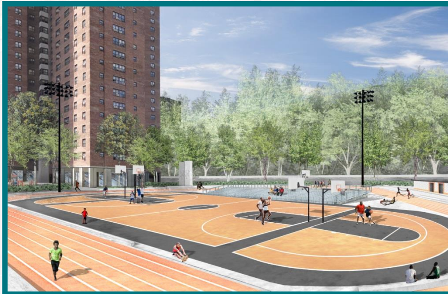
Proposed Track and Basketball Courts